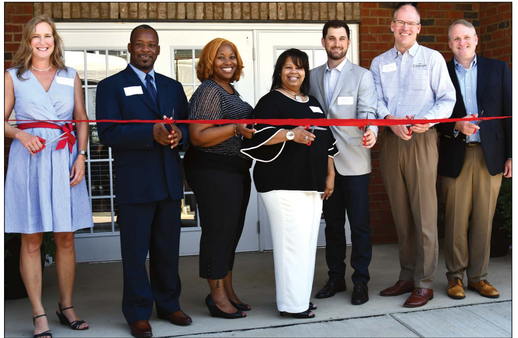
Ribbon cutting for the Parkside at Bethel, Clover, SC. (Housing Tax Credit funding)

SC Housing maintains a Moody's bond rating of Aaa. This has allowed us a consistent stream of funding to finance more than $2.73 billion in loans to nearly 19,926 homeowners in our state since we began our Homebuyer Program.