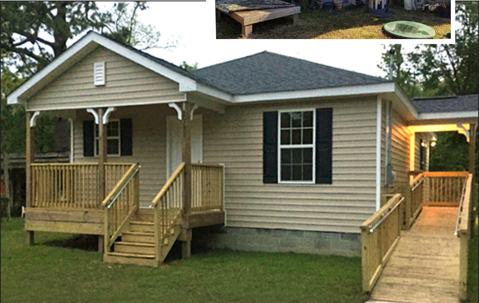
Disaster recovery rehabilitation before and after, Horry County