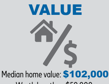
Median home value: $102,00 Worth less than $50,000: 12,6%

Single-family detached: 54.2% Mobile homes: 39.1% All other housing units: 6.7%