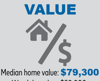
Worth less than $50,000: 13.5%

Single-family detached: 57.9% Mobile homes: 34.4% All other housing units: 7.7%