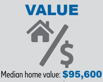
Median home value: $95,600 Worth less than $50,000: 11.8%

Single-family detached: 72.1% Mobile homes: 20.4% All other housing units: 7.5%